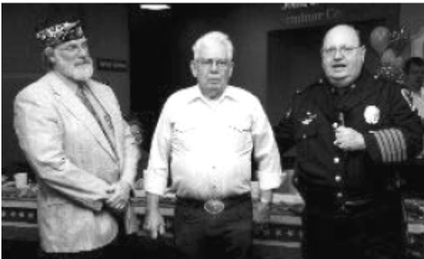
Shawnee NewsStar – April 29, 2006

A Soldier of the Year, police officers, firefighters, educators and other community leaders were honored during the American Legion's annual awards banquet in Shawnee April 18, 2006.